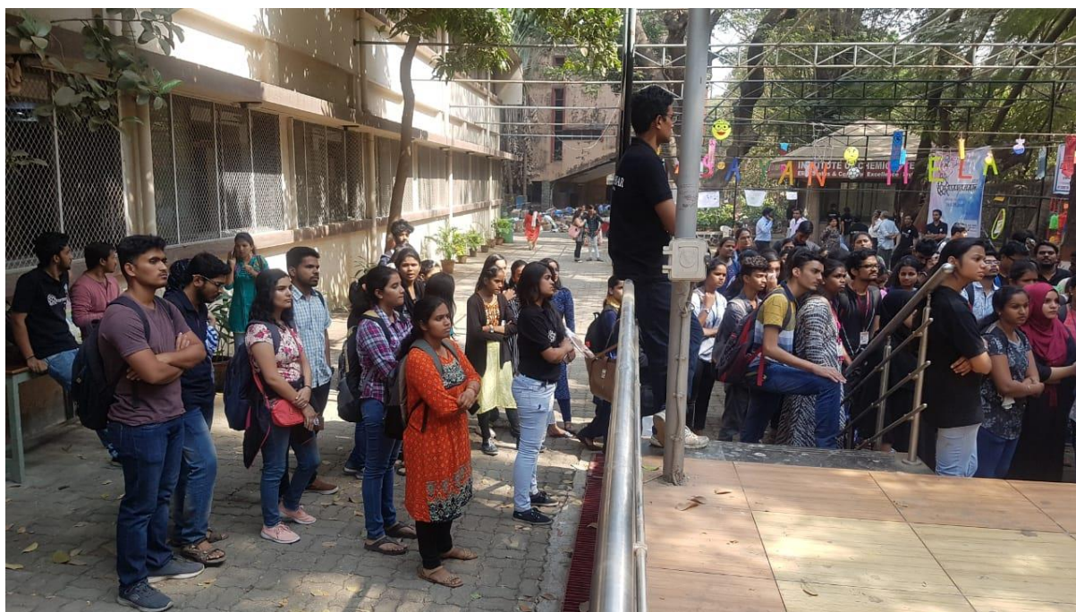
MSc- Part 2 students at the "Rasaynam" even at ICT.

In the nanotechnology section, X-ray diffraction and SEM were shown and explained briefly. The faculty and volunteers also gave the students a tour of their annual event "Rasaynam" wherein our students were shown different games related to chemistry.